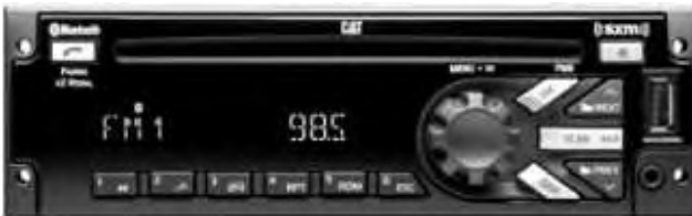
Illustration 3 g03566571 MP3/USB/iPod/Aux/Bluetooth/CD/SAT Receiver