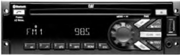
Illustration 2 g03566527 MP3/USB/iPod/Aux/Bluetooth/CD Receiver