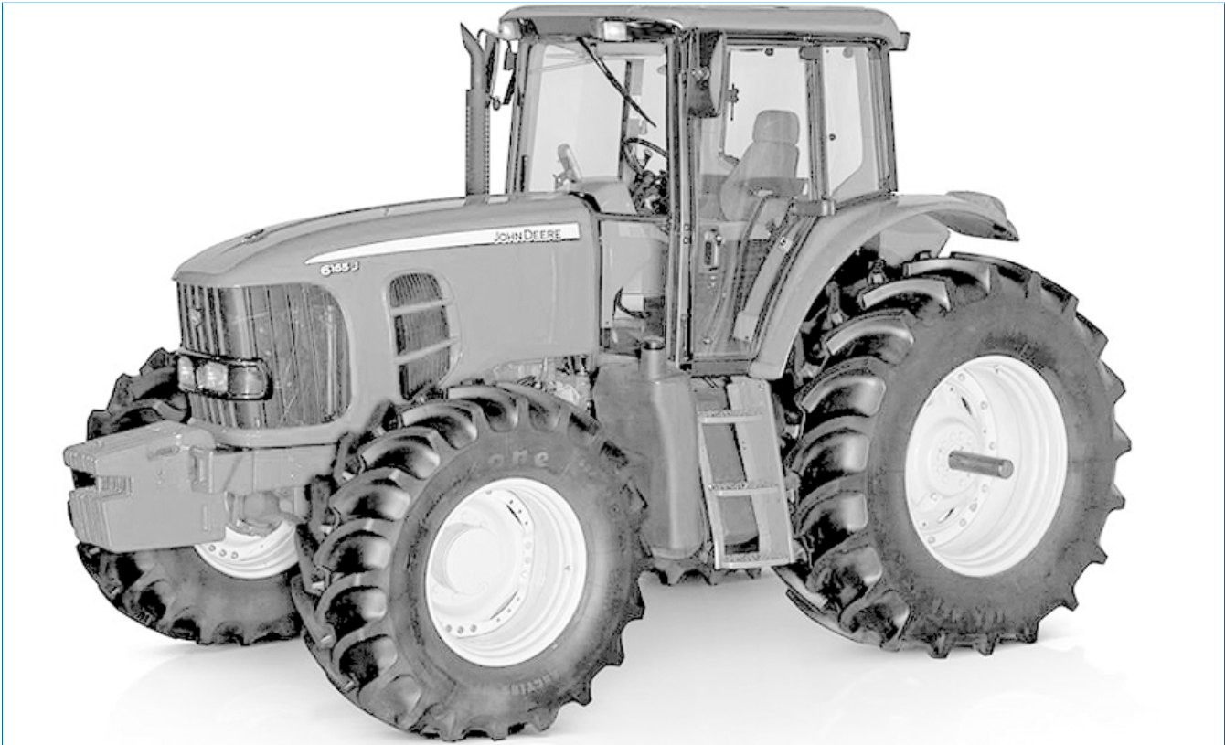
YHA000102-UN: 6165J and 6185J Tractors