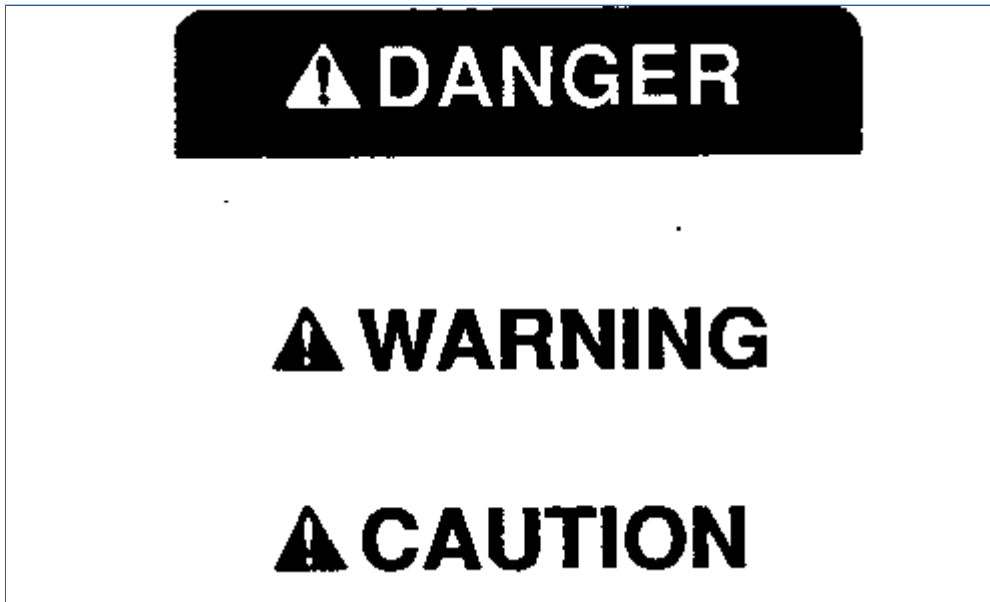
TS187-19: Signal Words

A signal word—DANGER, WARNING, or CAUTION—is used with the safety-alert symbol. DANGER identifies the most serious hazards.