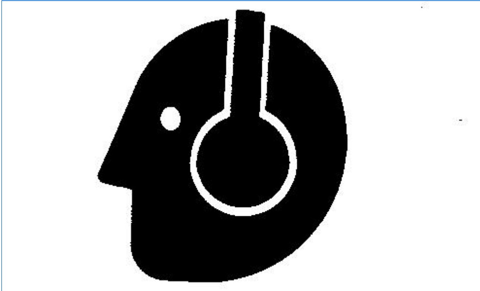
TS207-UN: Noise Exposure

Prolonged exposure to loud noise can cause impairment or loss of hearing.