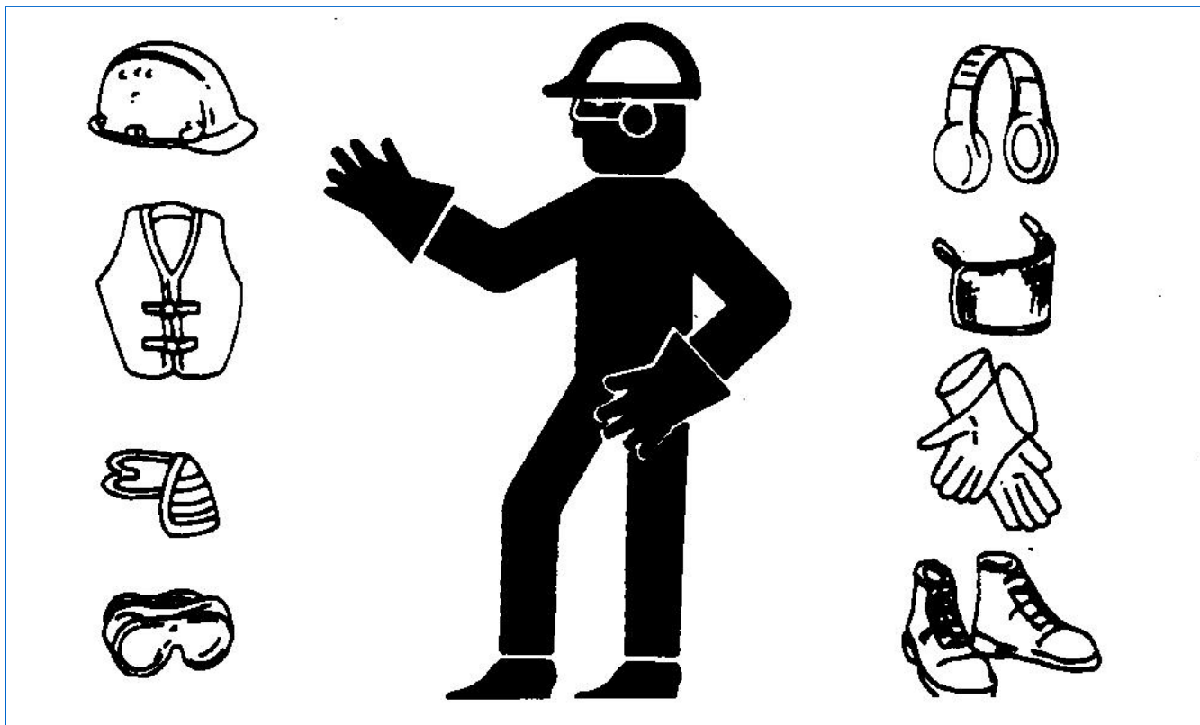
TS206-UN: Protective Clothing

Wear close fitting clothing and safety equipment appropriate to the job.