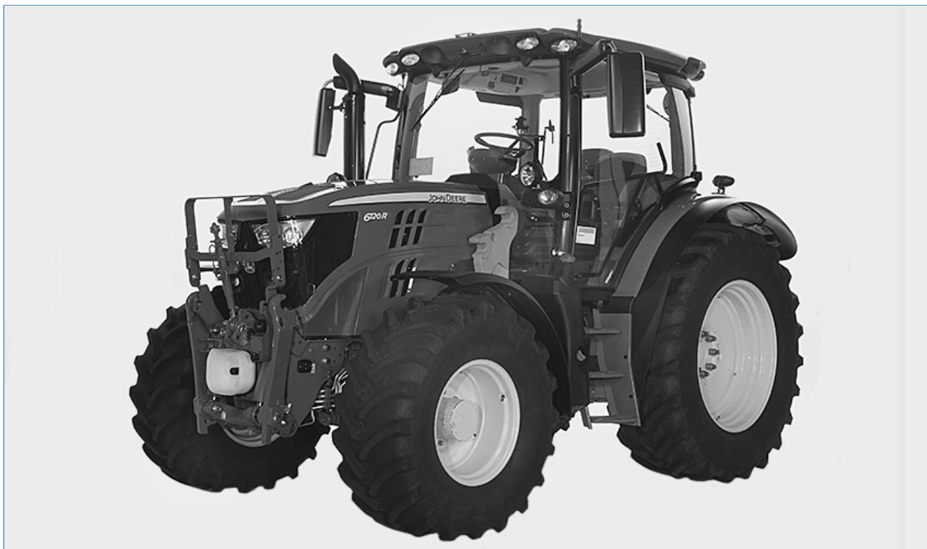
LX1057429-UN: Tractor Shown with Additional Equipment