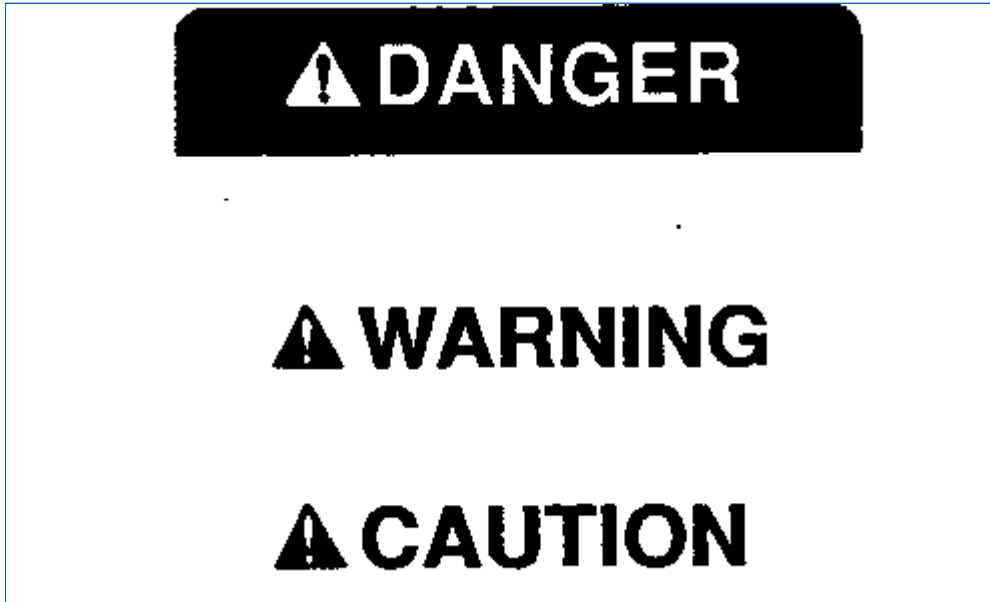
TS187-19: Signal Words

A signal word—DANGER, WARNING, or CAUTION—is used with the safety-alert symbol. DANGER identifies the most serious hazards.