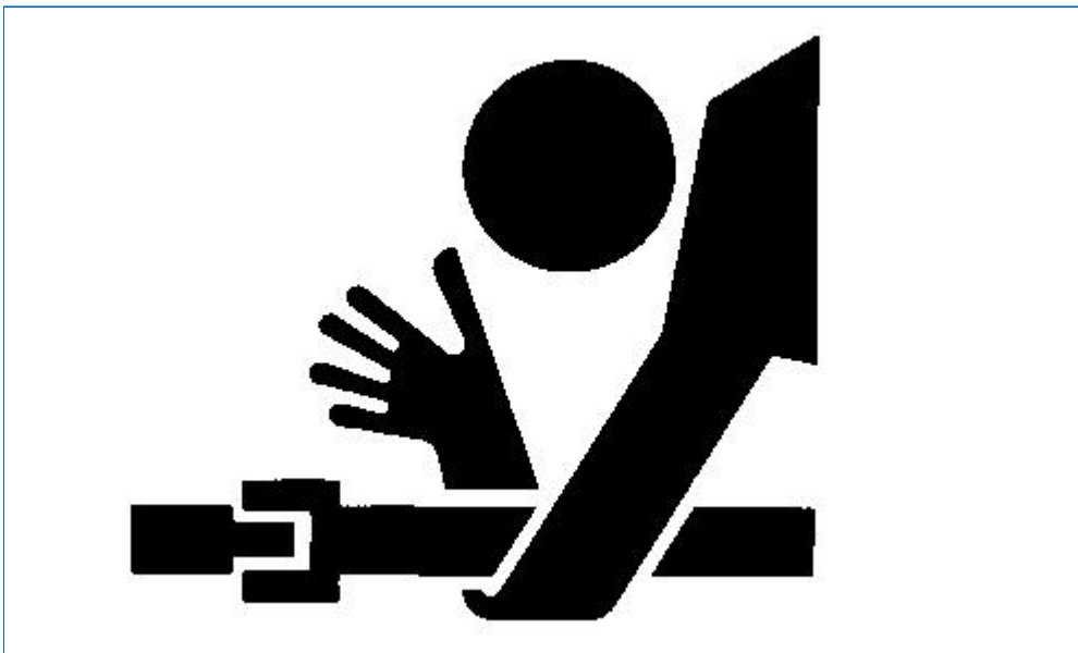
TS276-UN: Avoid PTO Shafts

Careless use of the tractor can result in unnecessary accidents. Be alert to hazards of tractor operation. Understand causes of accidents and take every precaution to avoid them. Most common accidents are caused from: