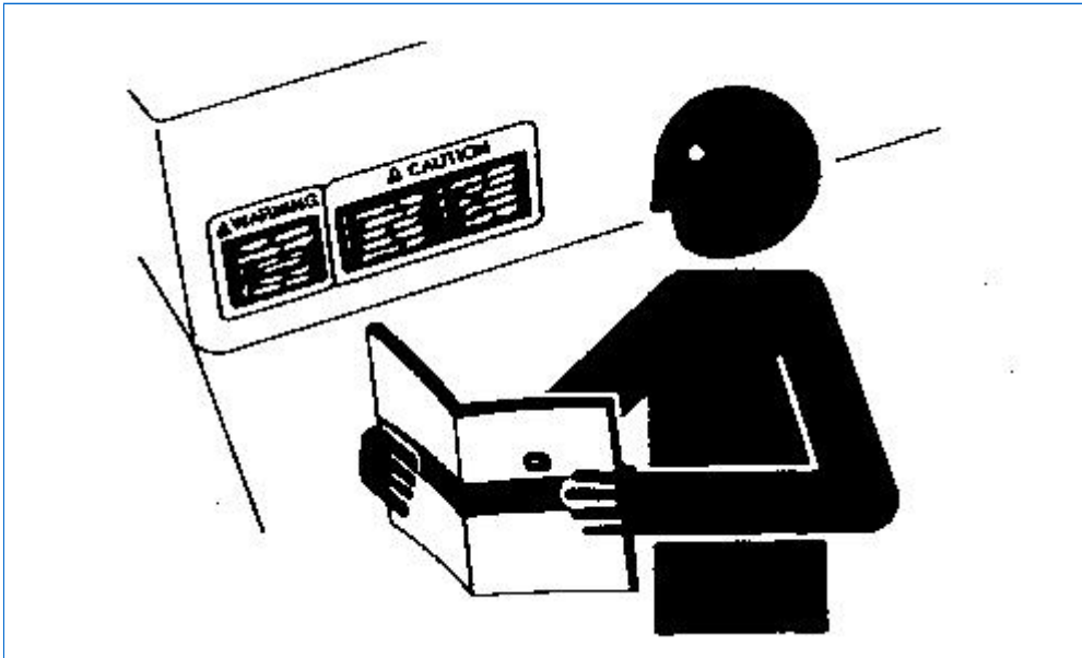
TS201-UN: Safety Messages

Carefully read all safety messages in this manual and on your machine safety signs. Keep safety signs in good condition. Replace missing or damaged safety signs. Be sure new equipment components and repair parts include the current safety signs. Replacement safety signs are available from your John Deere dealer.