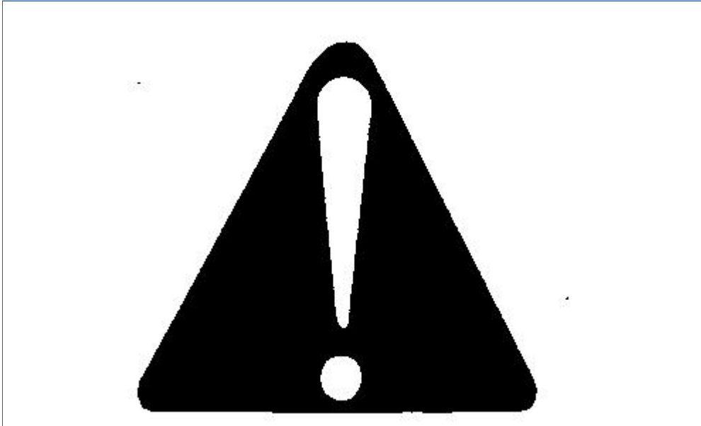
T81389-UN: Safety-alert symbol

This is a safety-alert symbol. When you see this symbol on your machine or in this manual, be alert to the potential for personal injury.