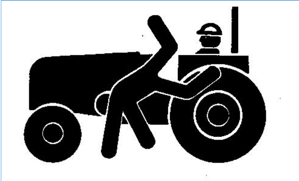
TS213-UN: Stay Clear of Moving Tractor