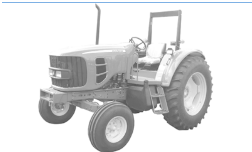
PY18339-UN: 6105J Tractor