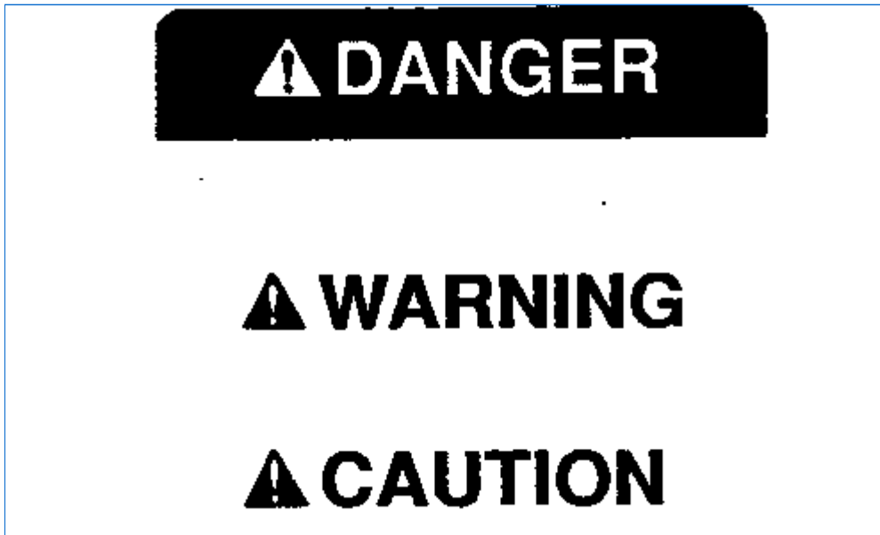
TS187-19: Signal Words

A signal word—DANGER, WARNING, or CAUTION—is used with the safety-alert symbol. DANGER identifies the most serious hazards.