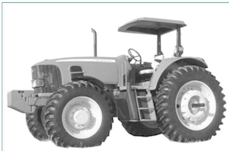
P16053-UN: 6140J MFWD Tractor