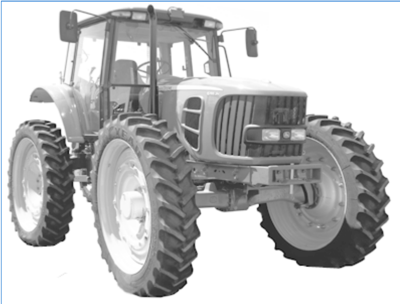
PY14080-UN: 6155JH Tractor