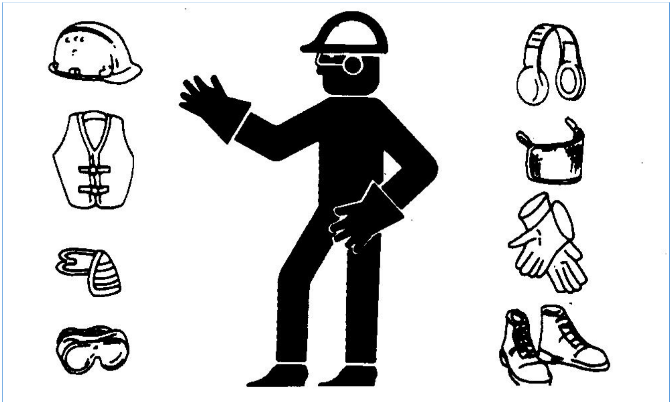
TS206-UN: Protective Clothing

Wear close fitting clothing and safety equipment appropriate to the job.