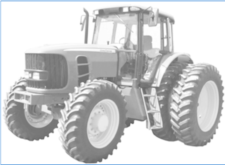
P16054-UN: 6155J Cab Tractor