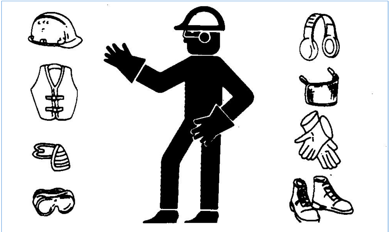
TS206-UN: Protective Clothing

Wear close fitting clothing and safety equipment appropriate to the job.