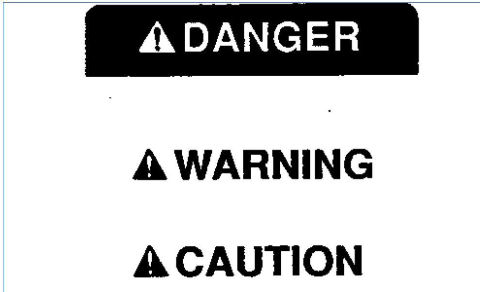
TS187-19: Signal Words

A signal word—DANGER, WARNING, or CAUTION—is used with the safety-alert symbol. DANGER identifies the most serious hazards.