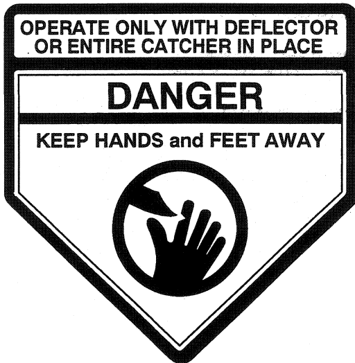
ON DISCHARGE ELBOW (Part No. 93-1122) (Part No. TR93D1122)