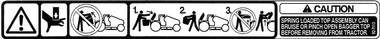
ON BAGGER HINGE FRAME (Part No. 92-7113) (Part No. TR92D7113)

Safety decals and instructions are easily visible to the operator and are located near any area of potential danger. Replace any decal that is damaged or lost.