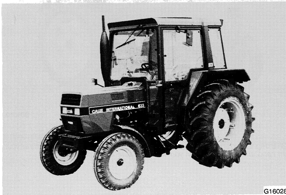
TRACTOR WITH COMBI CAB