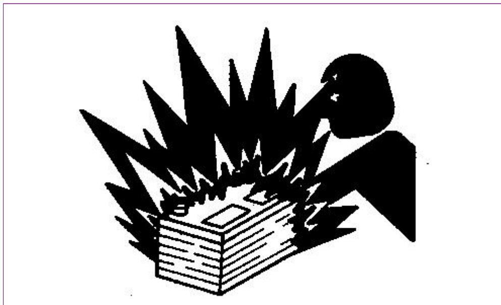
TS204-UN: Battery Explosions

Keep sparks, lighted matches, and open flame away from the top of battery. Battery gas can explode.