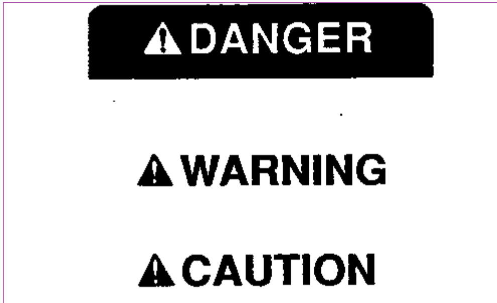
TS187-19: Signal Words

A signal word—DANGER, WARNING, or CAUTION—is used with the safety-alert symbol. DANGER identifies the most serious hazards.