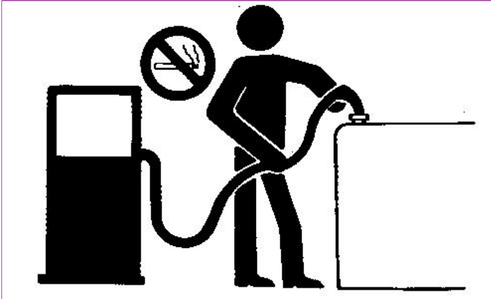
TS202-UN: Avoid Fires

Handle fuel with care: it is highly flammable. Do not refuel the machine while smoking or when near open flame or sparks.