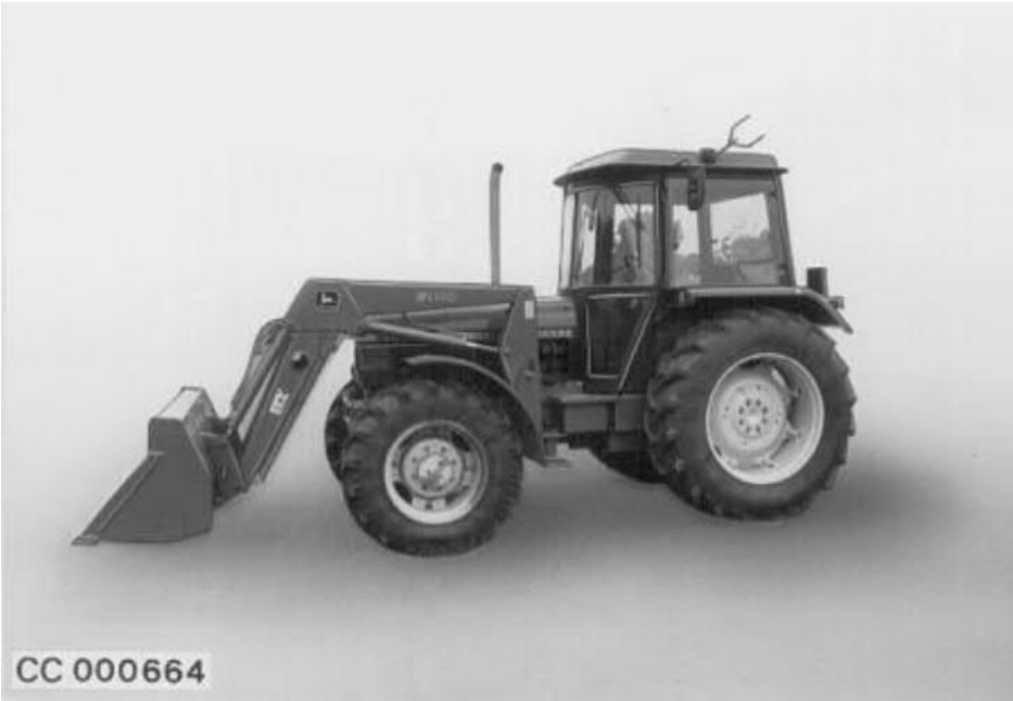
540A NSL Loader*