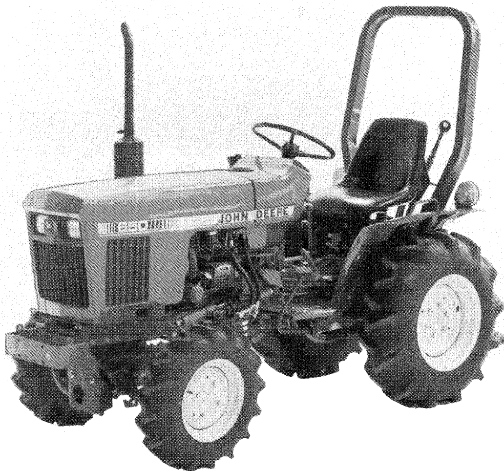
John Deere 650 Tractor